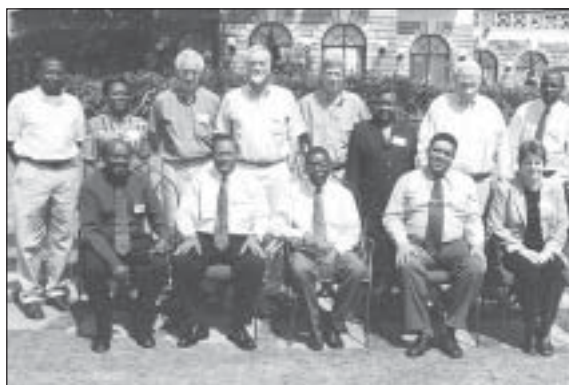
Participants in African Health Research Forum workshop, Kenya, May 2004

it to evolve into a 'network of networks', and to refocus the scope of its operations to better effect. These initiatives will be followed up in 2005.