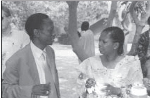
Participants at the workshop in Saly (Senegal), March, 2004