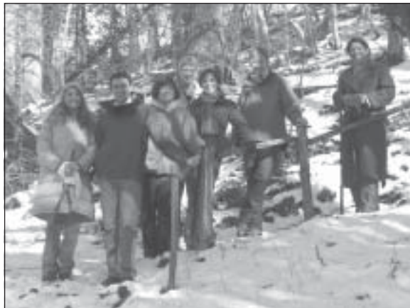
The COHRED staff at the beginning of 2005.