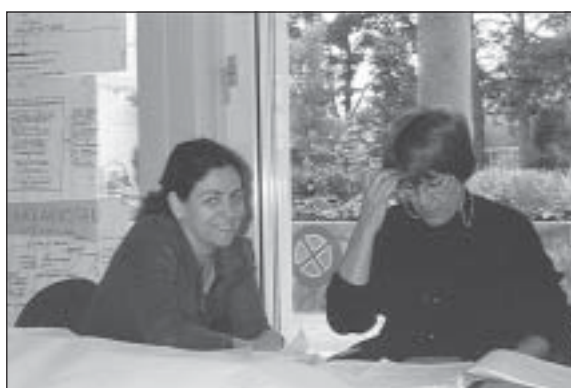
Participants at resource flows monitoring workshop, Geneva, 2002