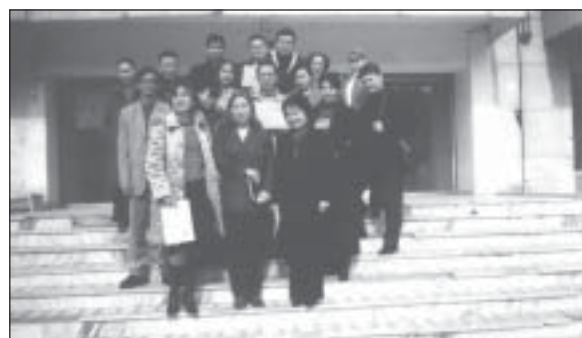
Students of the Young Researchers Program, Kazakhstan

In principle, the KSPH promotes 'on the job – on campus' training to reduce the disruption of health services during their course work. Researchers enrolled in the program often continue working in health research institutions and, therefore, contribute