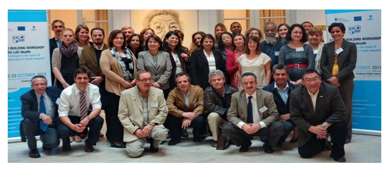
Project's members and participants in the last day of the workshop held in Buenos Aires

The second "Scenario Building Workshop" will be held in Italy, (Rome) in April 2013. It is planned as a continuation of the Buenos Aires Scenario-Workshop. The results will here be narrowed and worked with aiming at a consensus in common funding acceptable for all countries in the regions and developing a first draft of the common roadmap.